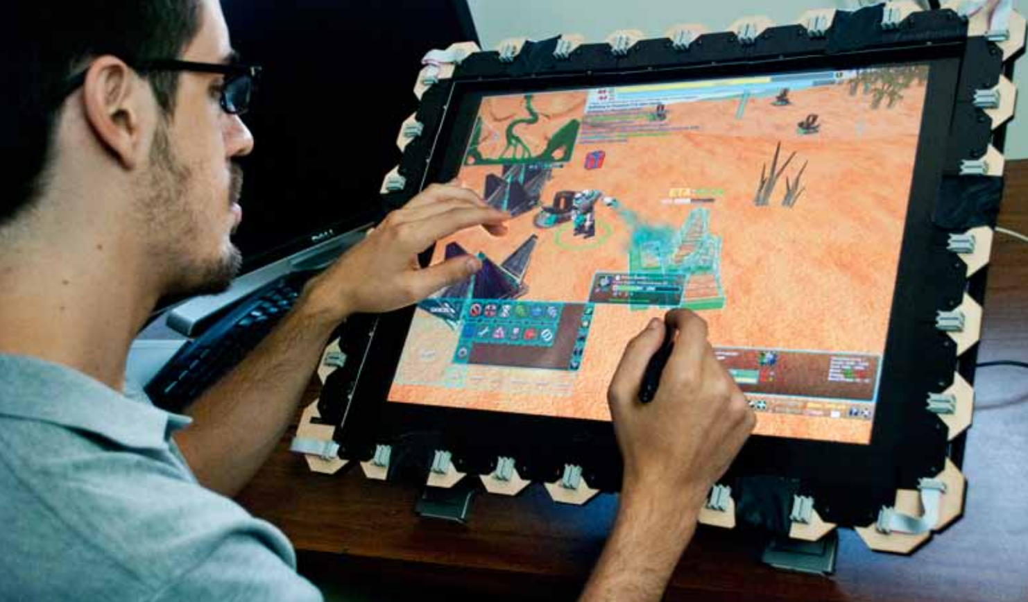
Moeller demonstrates how the ZeroTouch frame, which has been mounted to an ordinary LCD display, transforms the monitor into a multitouch interface, allowing for manipulation with fingers or, for greater precision, a stylus.

ZeroTouch has many potential applications such as a training guide for surgeons that can track their fine hand movements, as well as for interactive instructions on how to construct and repair complicated machinery.